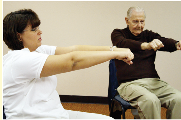
INFORMATION ABOUT UPCOMING A MATTER OF BALANCE CLASSES IS AVAILABLE ON OCCOA'S WEBSITE

989.732.1122 • www.OtsegoCountyCOA.org • Advocacy 989.732.9977